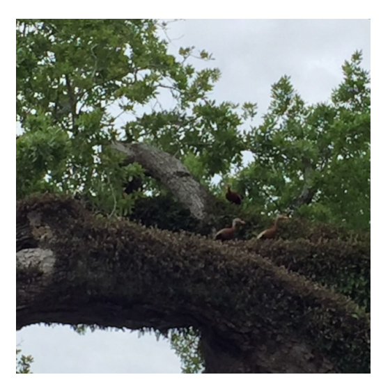
Our tree ducks have returned!